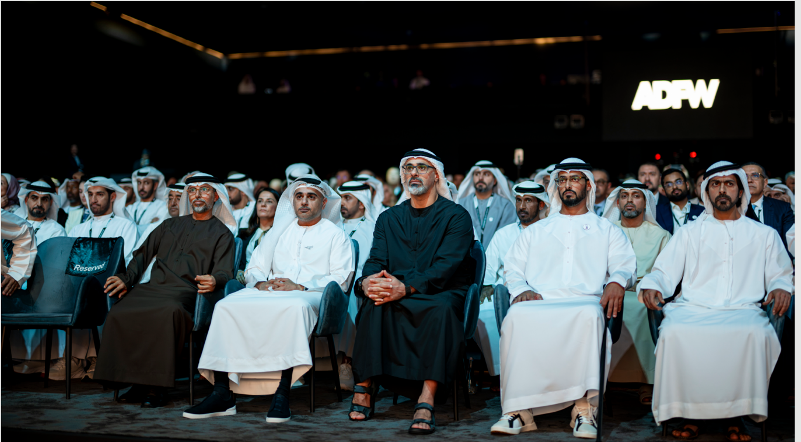
Khaled bin Mohamed bin Zayed attended opening of Abu Dhabi Finance Week 2025