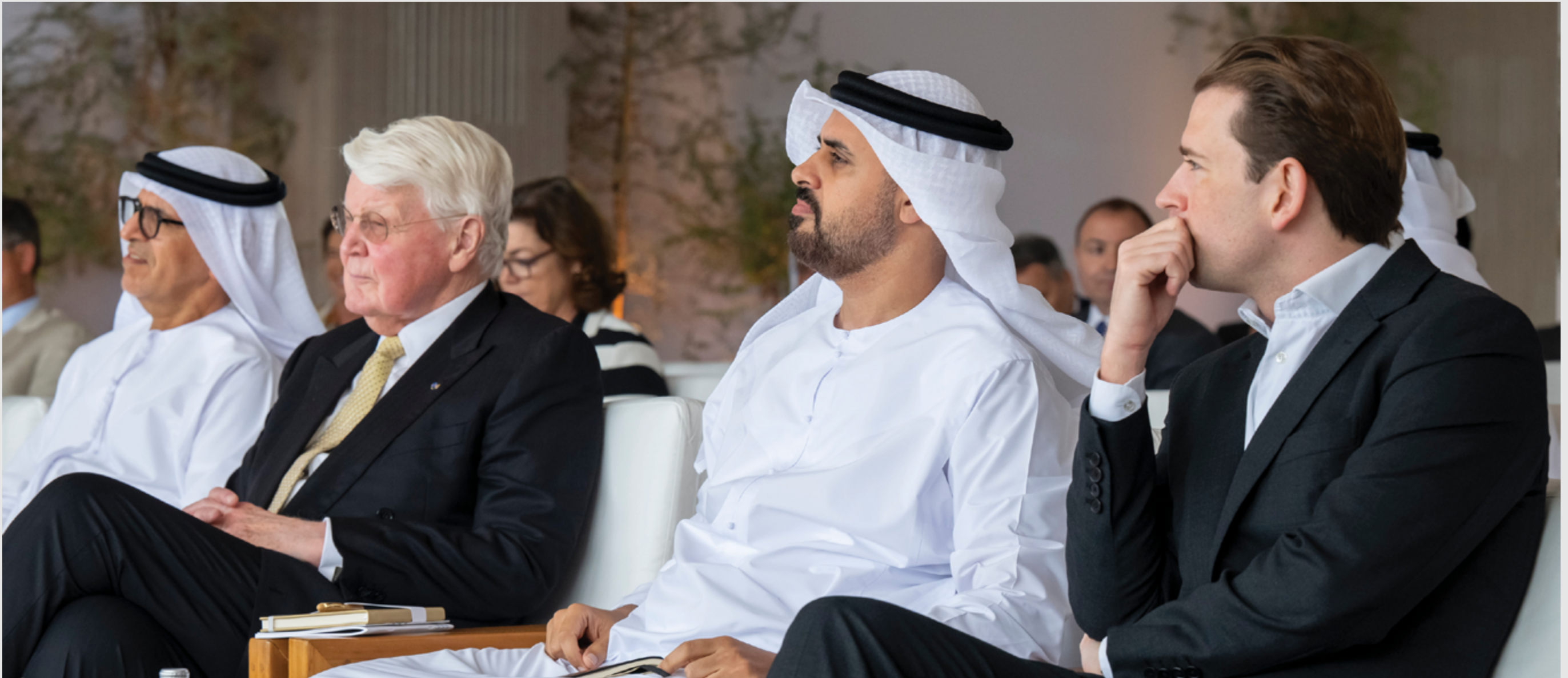
Theyab bin Mohamed bin Zayed attended International Development Dialogue in Abu Dhabi