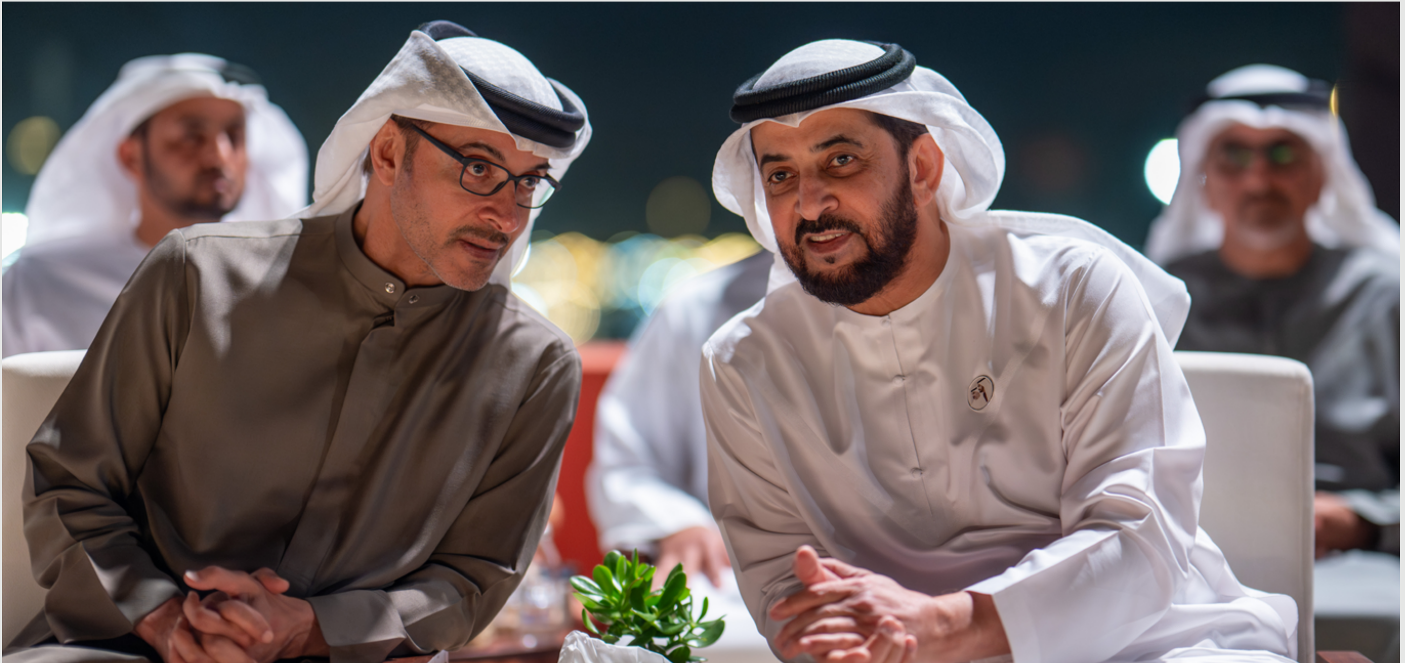
Hamdan bin Zayed and Hazza bin Zayed attended opening of Liwa International Festival 2026 (LIWA 2026)