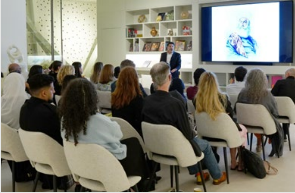
Bassam Freiha Art Foundation first Art History Evening fostered cultural dialogue