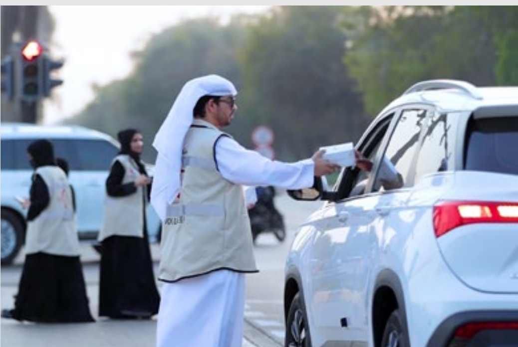
Emirates Red Crescent fostered community participation in Ramadan Continuous Giving campaign