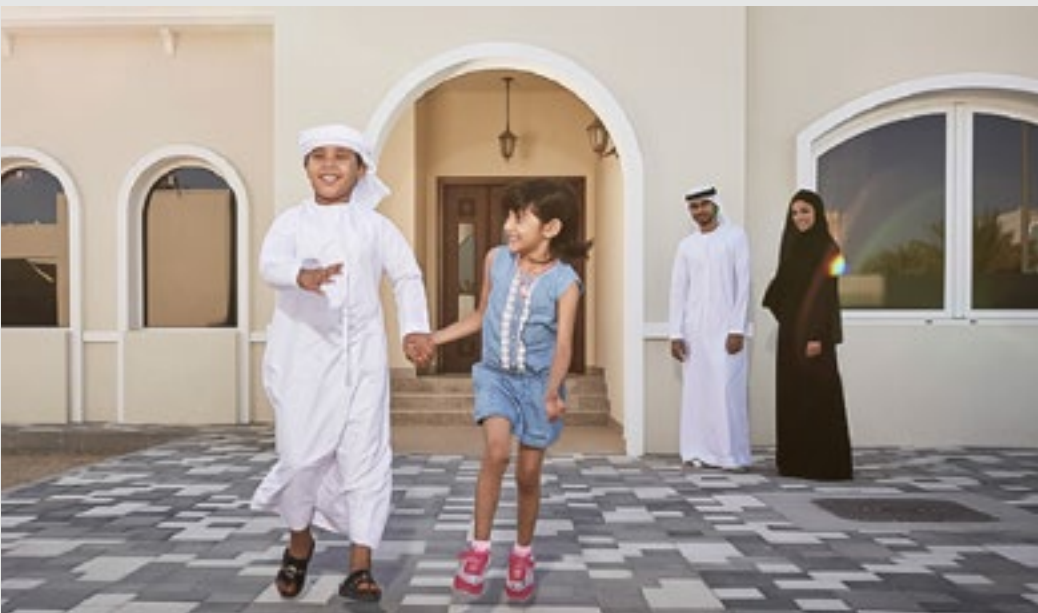
Abu Dhabi Civil Defence Authority issued prevention and safety guidelines during Eid Al Fitr holiday