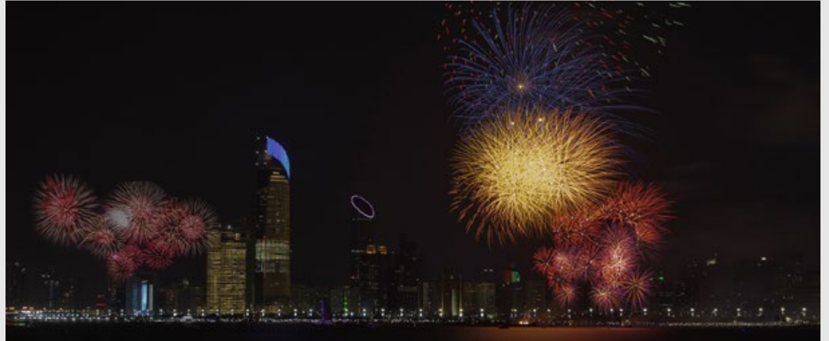
Fireworks held across Abu Dhabi for Eid Al Fitr celebrations