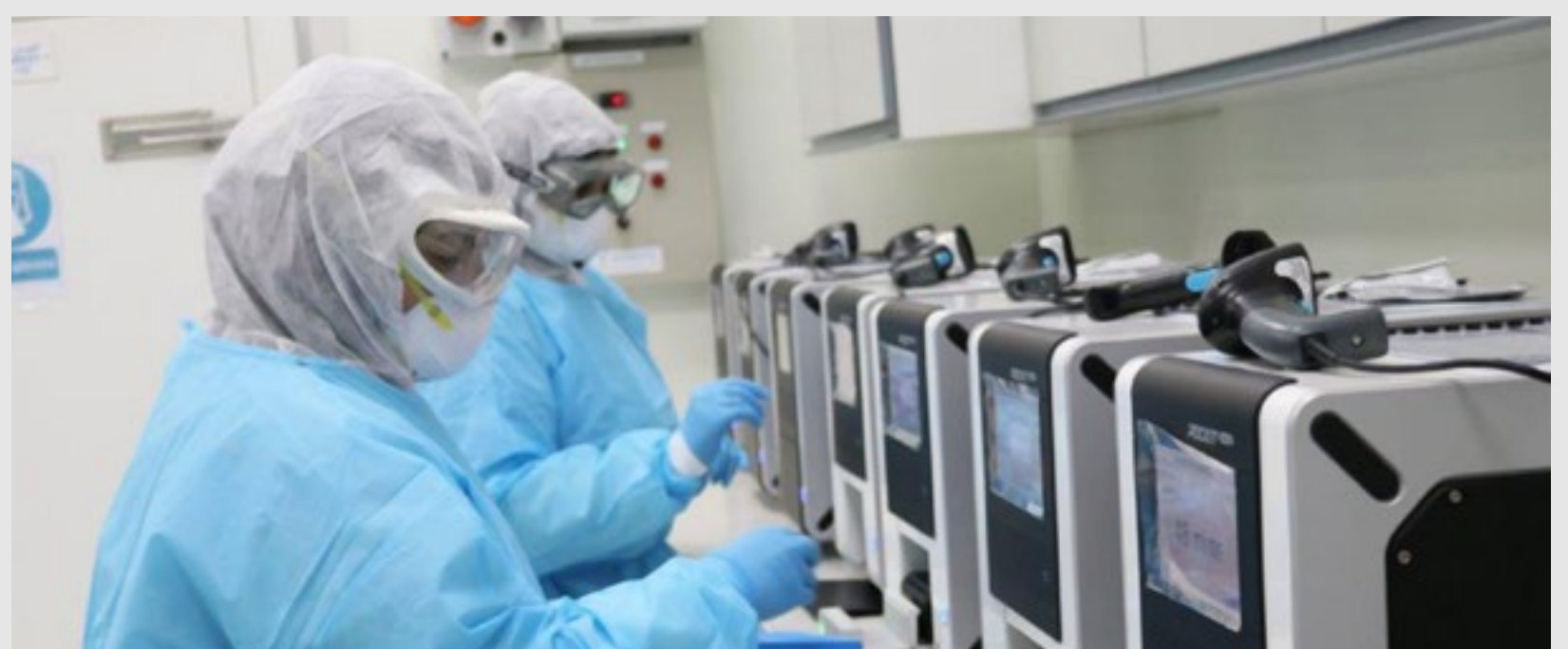
Abu Dhabi Agriculture and Food Safety Authority laboratories joined World Health Organization Coronavirus Network as reference laboratory