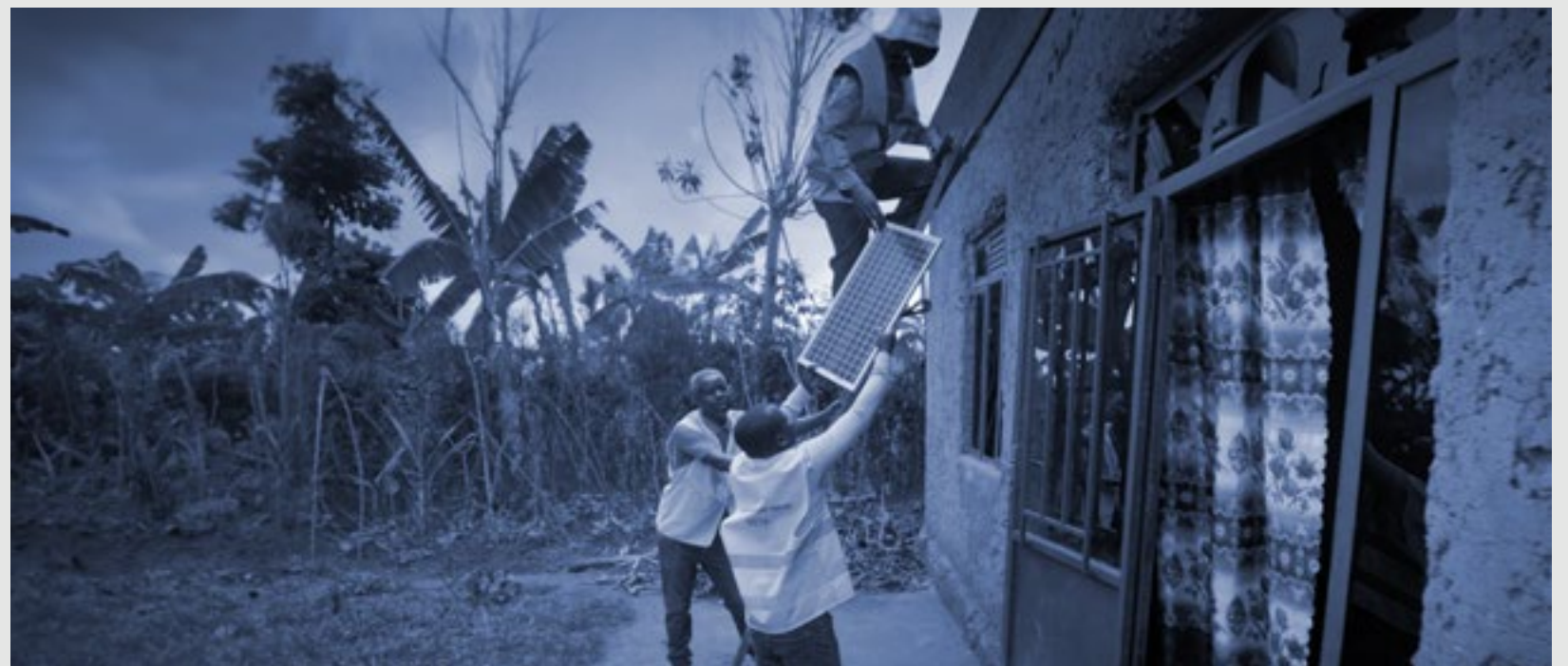
Zayed Sustainability Prize supported solar energy solutions in rural African communities